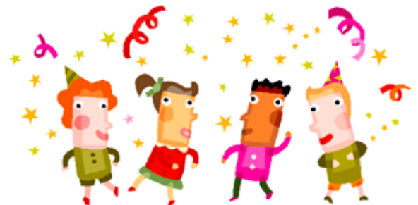
Spring Soiree - June 14, 7:00 p.m.